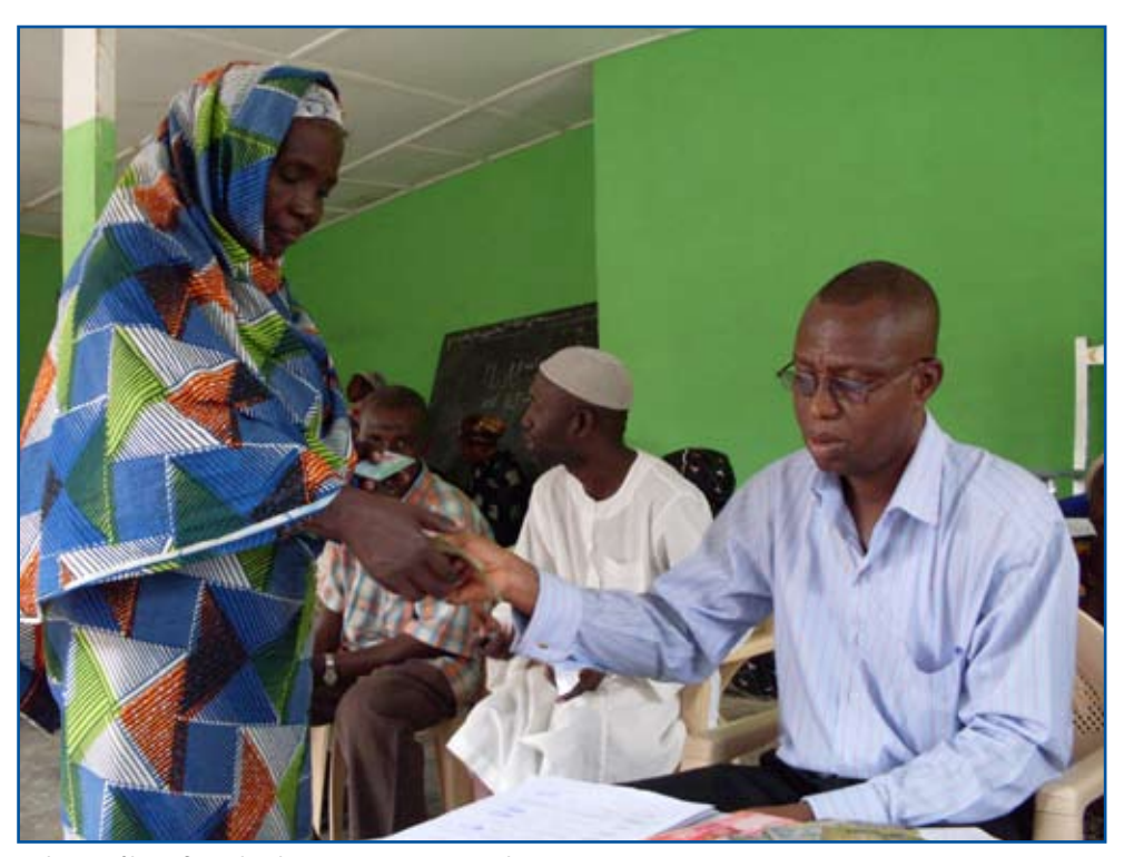
Delivery of benefit under the LEAP programme, Ghana.

The governments of Ghana and Kenya developed an interest in collaborating on social protection during a study tour to Brazil in August 2008. Until then, the two countries had known little about each other's major programmes. Social protection is a fairly new issue in Sub-Saharan Africa, and only in recent years has it been given greater expression and offered broader scope to the development of strategies and frameworks. This is largely because of the implementation of cash transfer programmes to replace the traditional food transfers where a case has been made for the need to invest in the well-being of the vulnerable populations. The agenda grew at the international level, where the earlier debate on the provision of services in the 1970s shifted to a later discussion about safety nets and labour markets in the face of post-structural adjustment programmes. More recently, social protection developed as a new framework; the definitions vary but there is agreement that the focus should be on the most vulnerable.