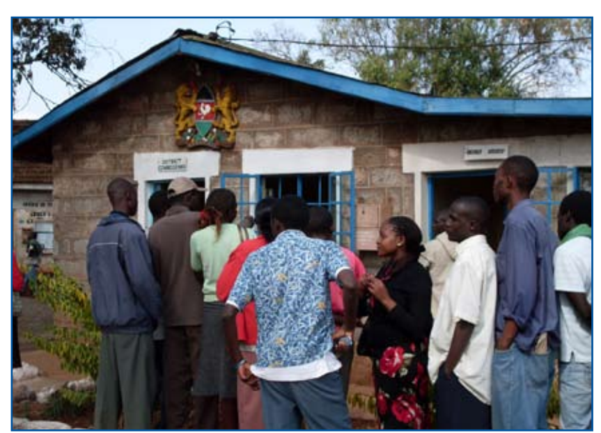
District government's office, Kasarani (Nairobi, Kenya).

Brazil's highly mobilised councils are complemented by local-level coordination of social protection. Basic social protection is provided through Social Assistance Reference Centres (CRAS). These work as focal points for a network of social assistance services at the local level, basically giving guidance to families on how to access public services. They work with the Specialised Social Assistance Reference Centres (CREAS) in cases of more serious social breakdown involving sexual abuse, child labour and homeless people. These coordination